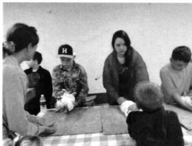
Rabbit Showmanship Clinic