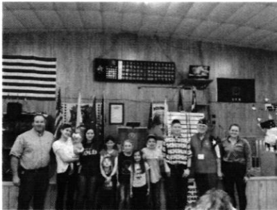
Donation to Sabine 4-H from the VFW