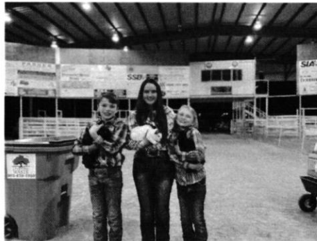
Sabine County Junior Livestock Show